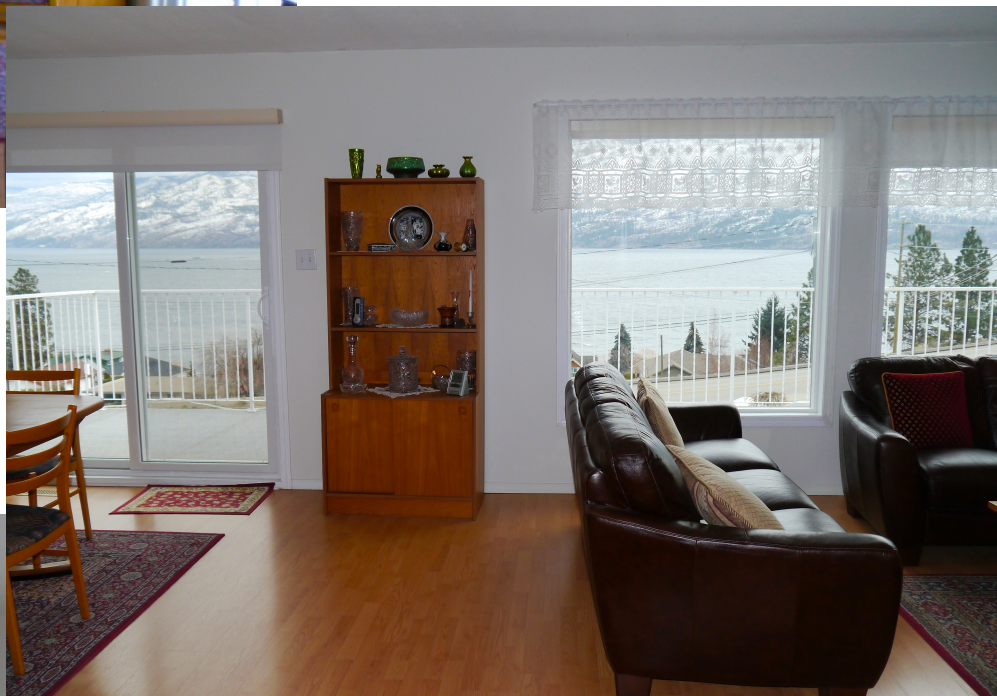
Vast, serene, lake and mountain views.