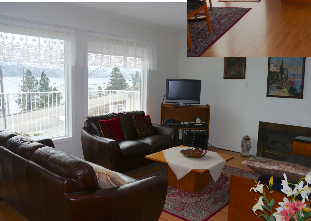
Gleaming floors, cozy fireplace.