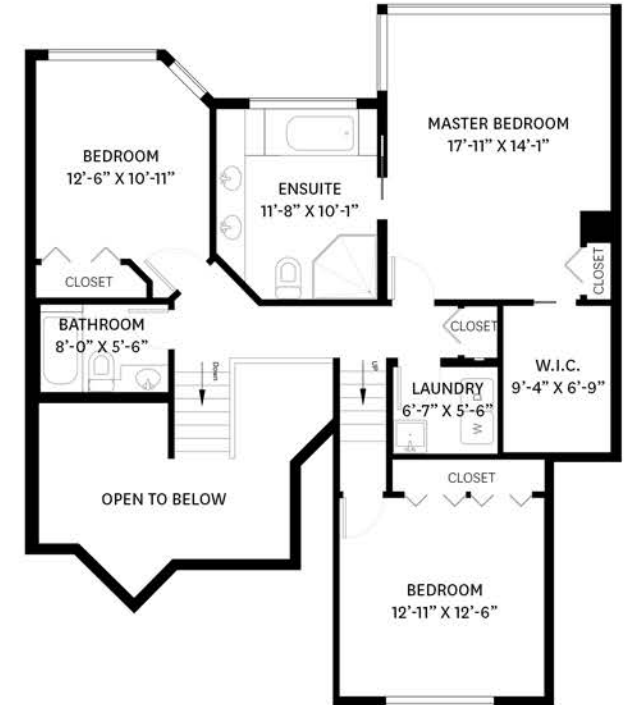
UPPER FLOOR PLAN Ceiling Height: 8'-11"