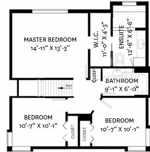
UPPER FLOOR PLAN Ceiling Height: