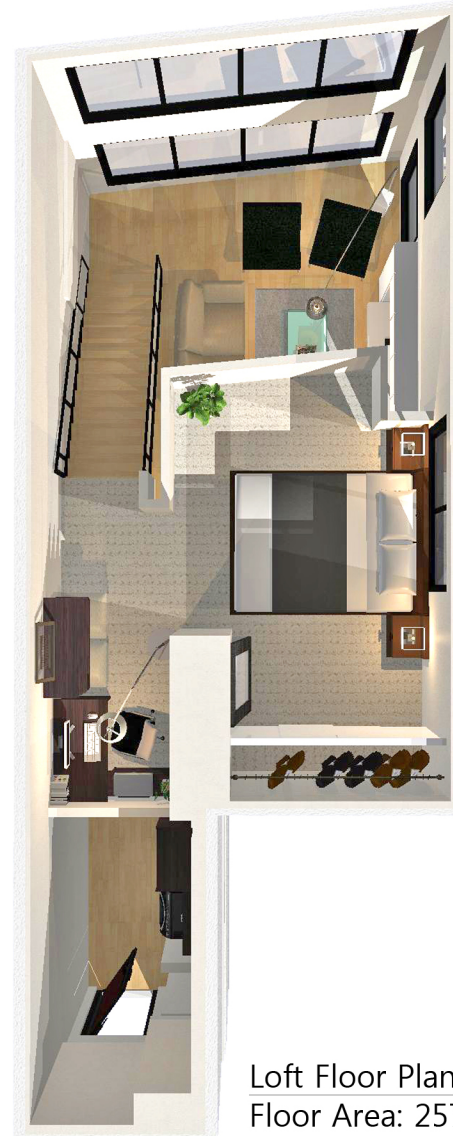
Loft Floor Plan Floor Area: 257 sq.ft.