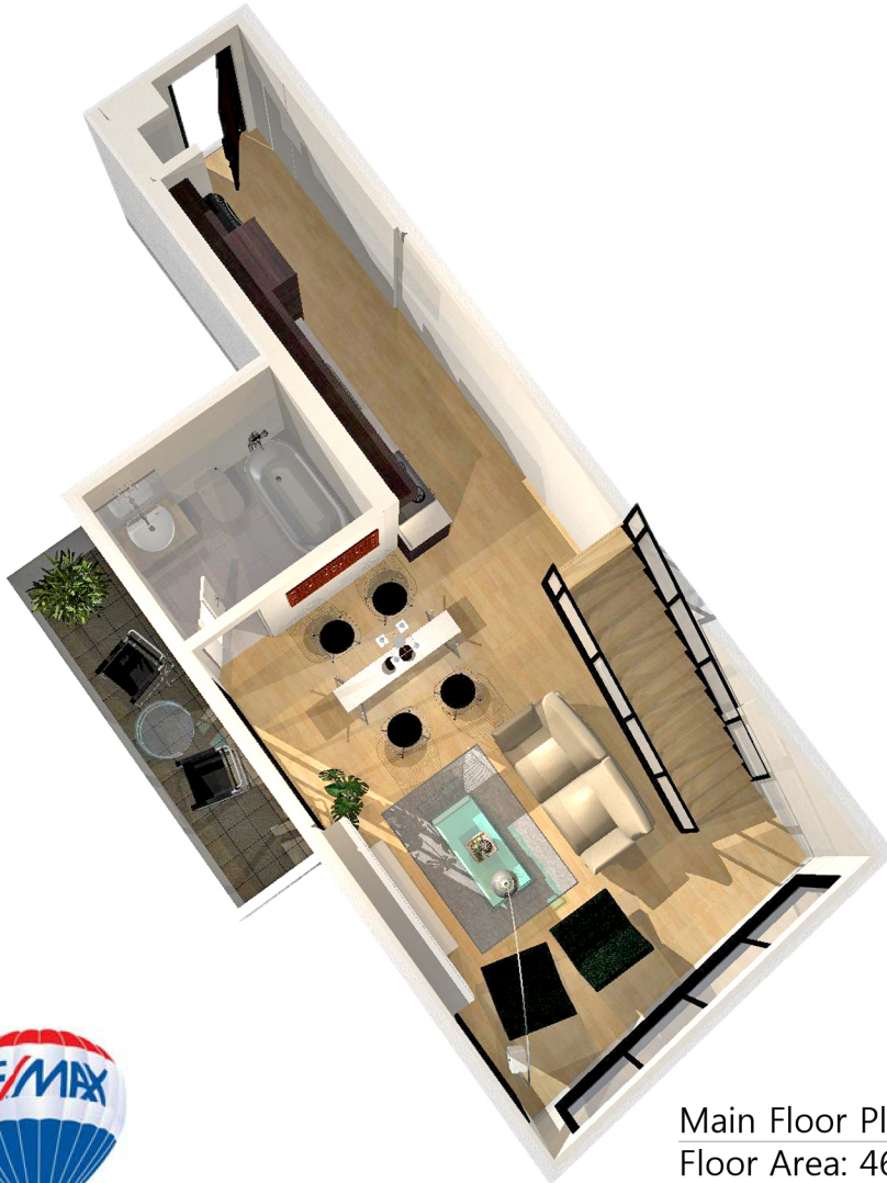
Main Floor Plan Floor Area: 468 sq.ft.

Balcony: 52 sq.ft. Open To Below: 210 sq.ft.