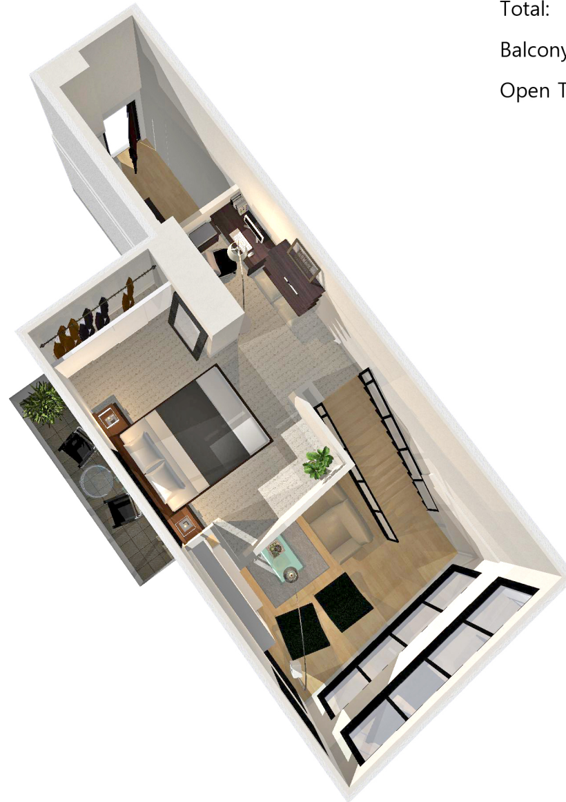
Loft Floor Plan Floor Area: 257 sq.ft.