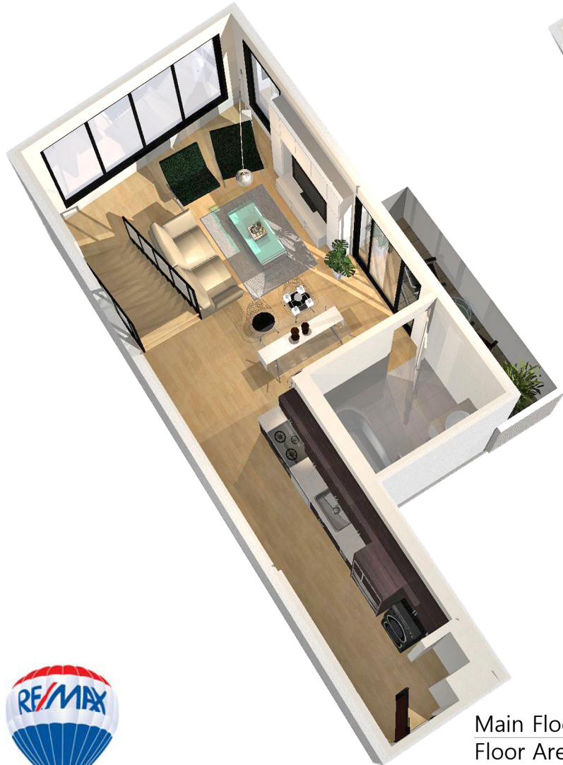
Main Floor Plan Floor Area: 468 sq.ft.