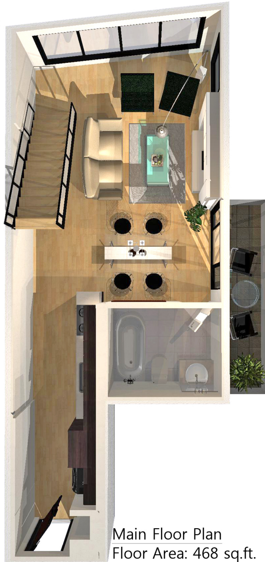
Main Floor Plan Floor Area: 468 sq.ft.