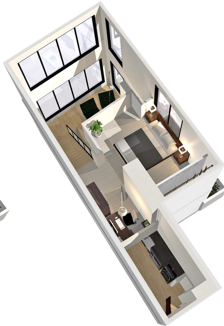
Loft Floor Plan Floor Area: 257 sq.ft.