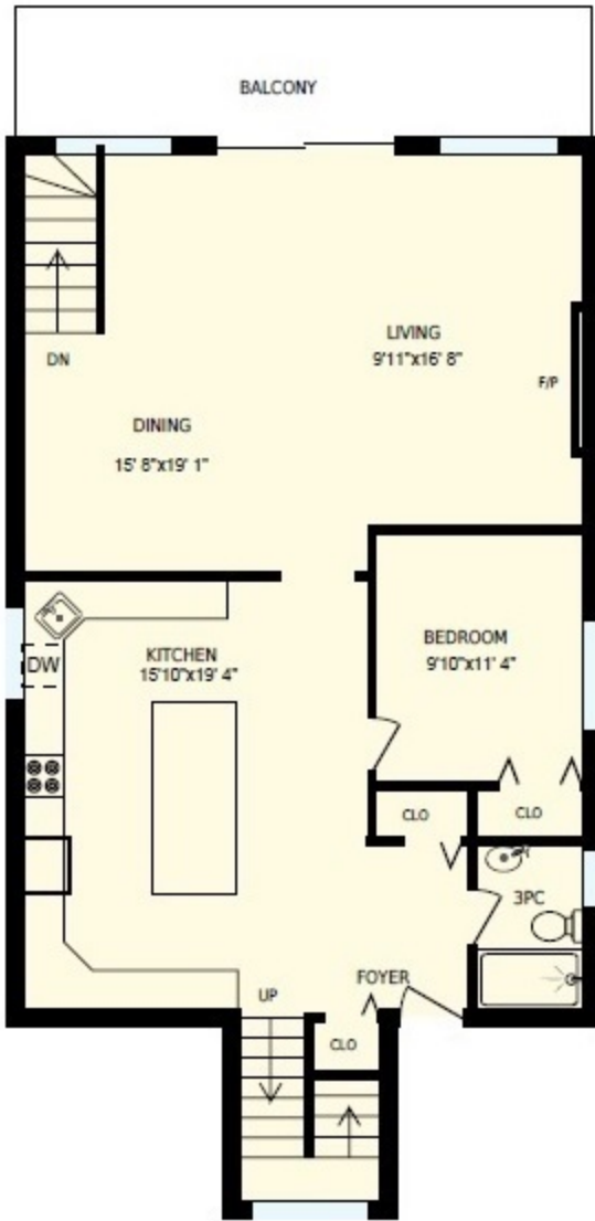
Main floor Exterior Area 1161 sq. ft