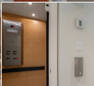
ELEVATOR INSIDE SUITE