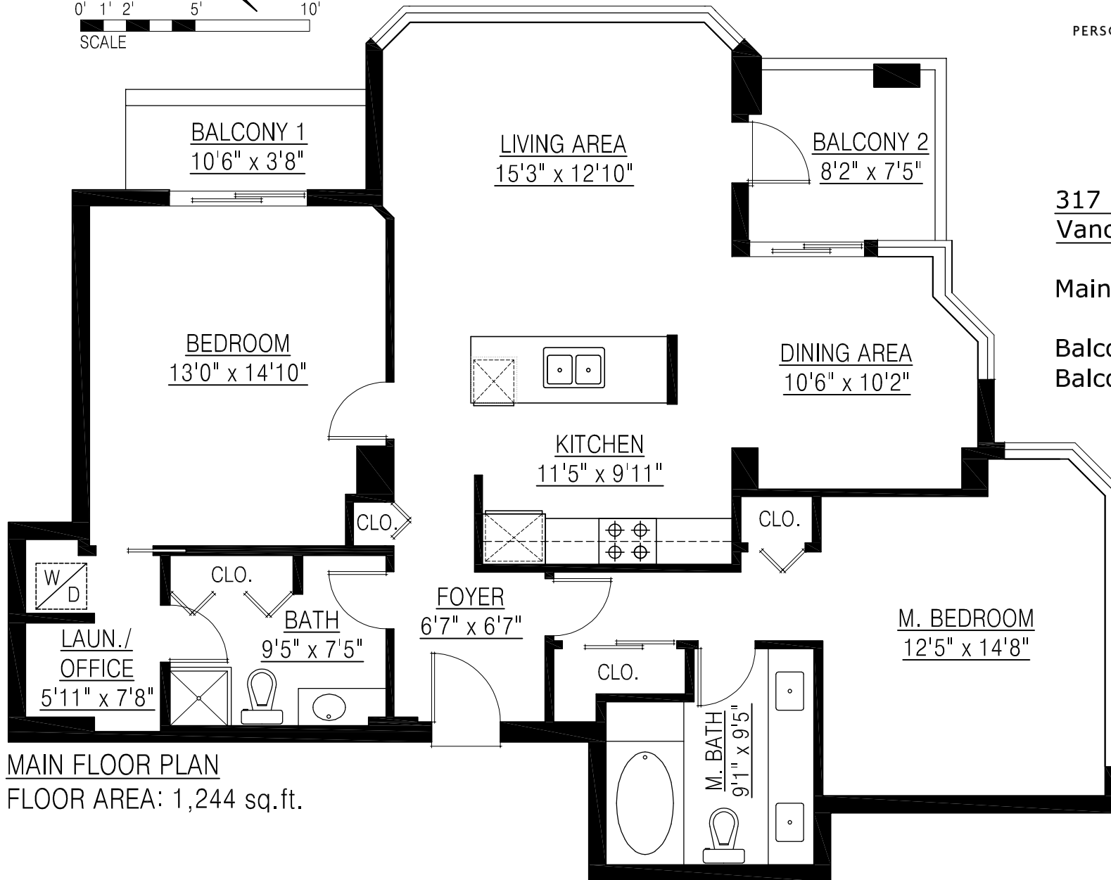
MAIN FLOOR PLAN FLOOR AREA: 1,244 sq.ft.