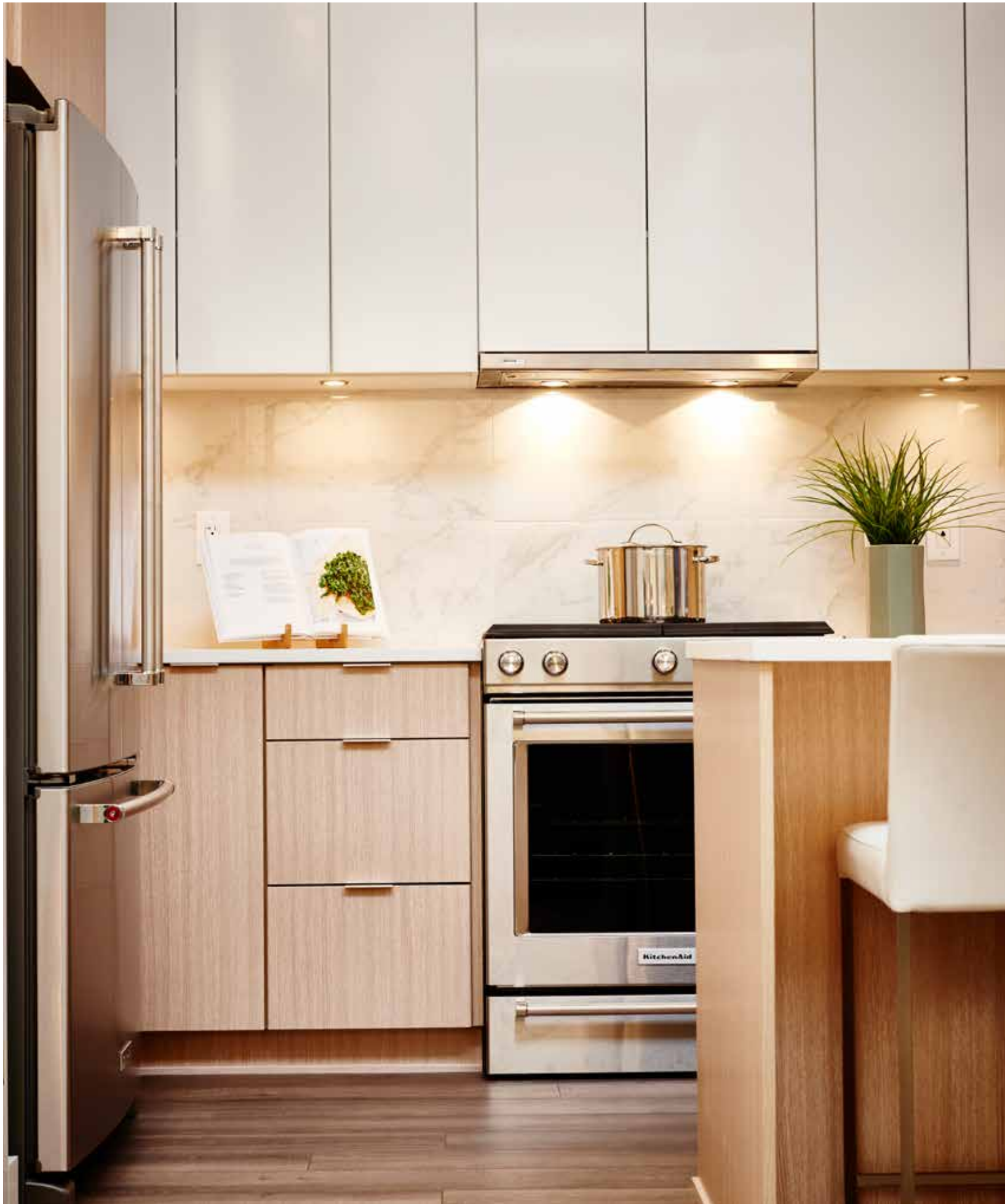
Kitchens are designed to engage you. The clean spaces feature full-size, stainless steel appliances, including a gas stove; there's also a double-basin sink and an island for extra workspace or dining.