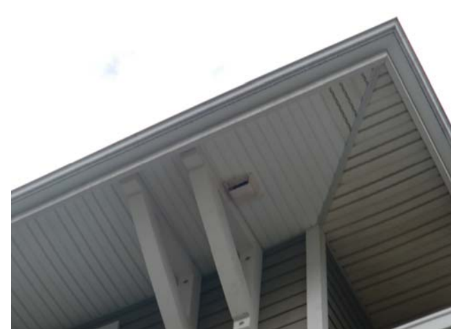
AcaciaGardens-Insp (5).JPG 07/06/2012