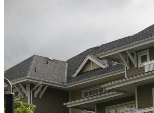
AcaciaGardens-Insp (11).JPG 07/06/2012