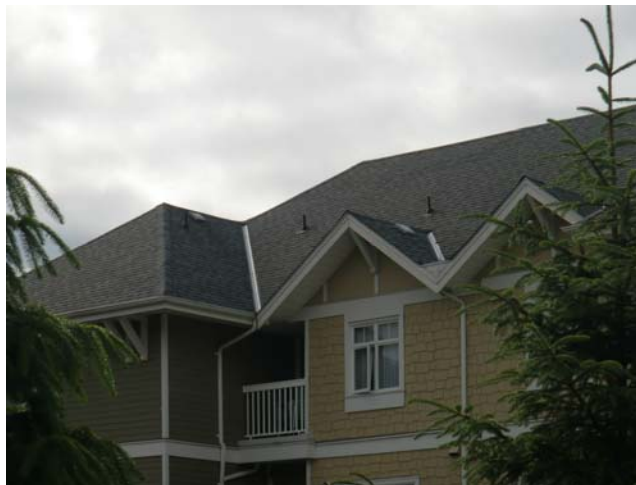
AcaciaGardens-Insp (13).JPG 07/06/2012