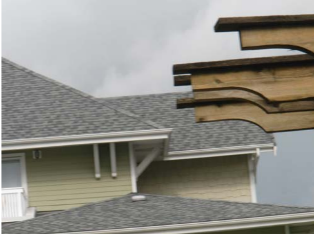
AcaciaGardens-Insp (1).JPG 07/06/2012