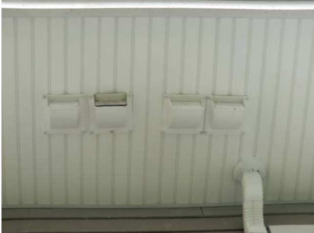
AcaciaGardens-Insp (3).JPG 07/06/2012