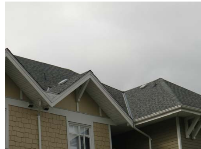
AcaciaGardens-Insp (14).JPG 07/06/2012