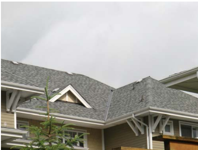
AcaciaGardens-Insp (12).JPG 07/06/2012