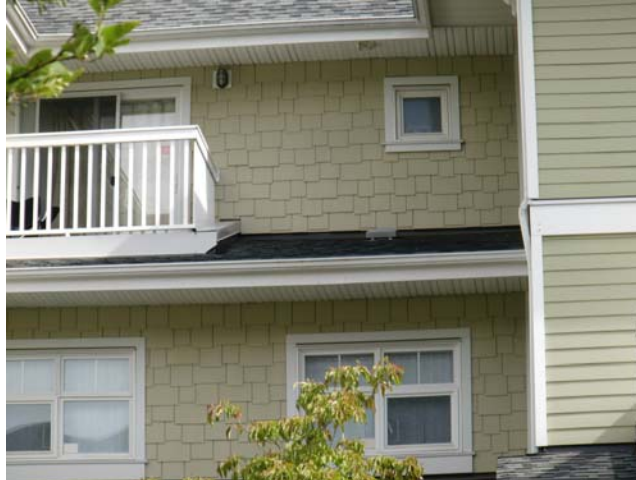
AcaciaGardens-Insp (10).JPG 07/06/2012