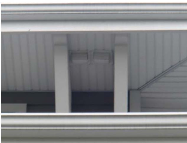
AcaciaGardens-Insp (7).JPG 07/06/2012