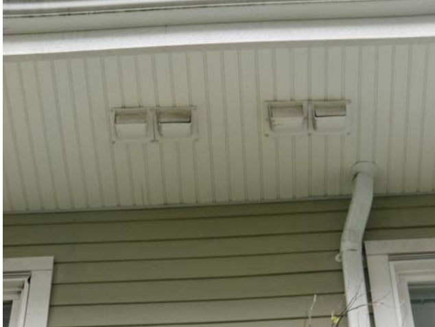
AcaciaGardens-Insp (4).JPG 07/06/2012