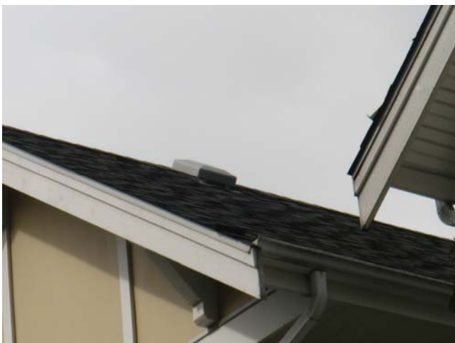
AcaciaGardens-Insp (9).JPG 07/06/2012