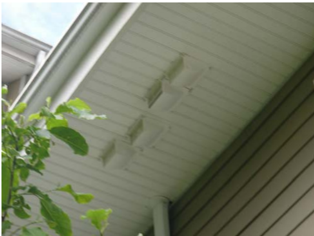
AcaciaGardens-Insp (6).JPG 07/06/2012