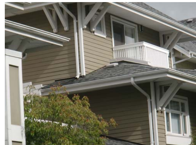
AcaciaGardens-Insp (2).JPG 07/06/2012