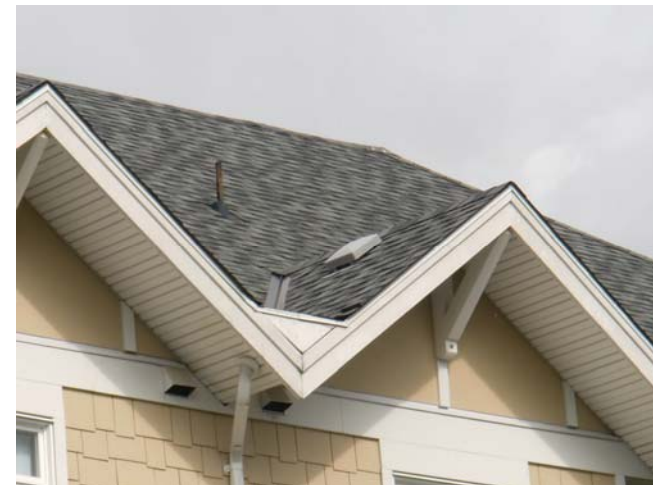
AcaciaGardens-Insp (8).JPG 07/06/2012