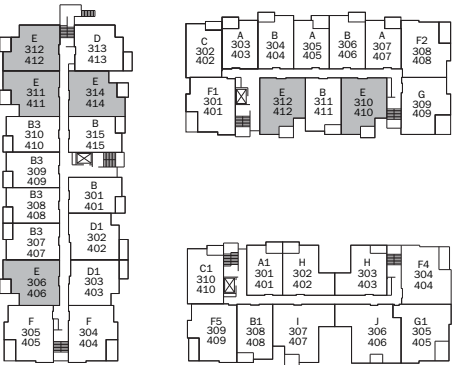
THIRD & FOURTH FLOOR