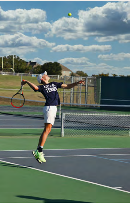
Oak Park Tennis Court - 4 min Drive

Forward-thinking in its location, AderaWest invites you to live at the brink of what makes Vancouver so famous: Modern amenities, an abundance of nature, high-walkability and easy access to the vibrant city centre.