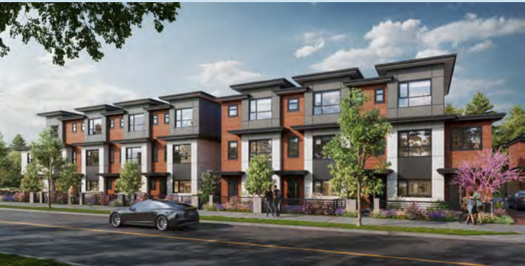
ONWARD | Richmond, BC