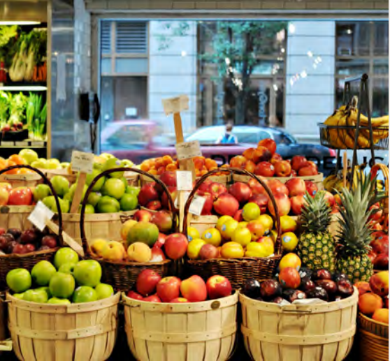
Choices Markets - 2 min Drive / 8 min Walk