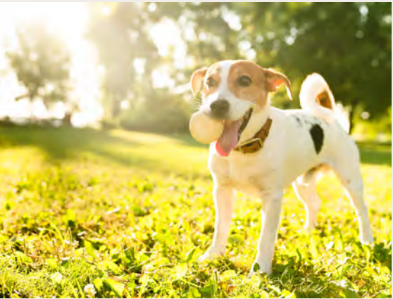
Maple Grove Dog Park - 4 min Drive