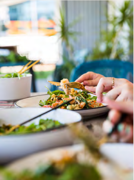
Okini Restaurant & Bar - 2 min Drive / 8 min Walk