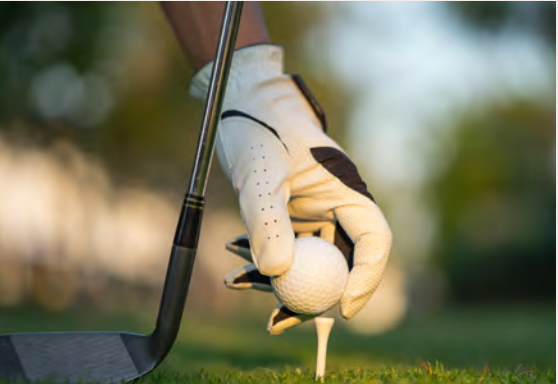
Marine Drive Golf Club - 4 min Drive