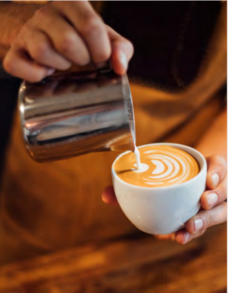
Bean Around The World Coffee - 2 min Drive / 8 min Walk