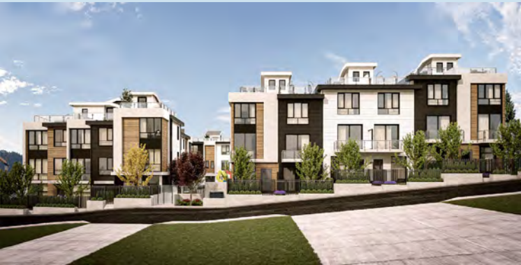
BURQVILLE | Burquitlam, BC

Kadium Properties is a culmination of passionate, creative, dedicated, and socially responsible people. Our ‘the right thing is the right way’ philosophy is central in our design, development, and construction of each project. We firmly believe that our approach will leave a trail of beautiful and beloved projects throughout the lower mainland and will establish a legacy of quality for years to come. We aim to design and develop environments that have a positive influence on the well-being of our families and their surrounding community. Our goal is, and always will be to create and deliver desirable living environments.