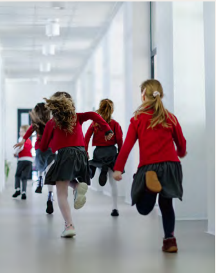
Magee Secondary School - 3 min Drive / 15 min Walk