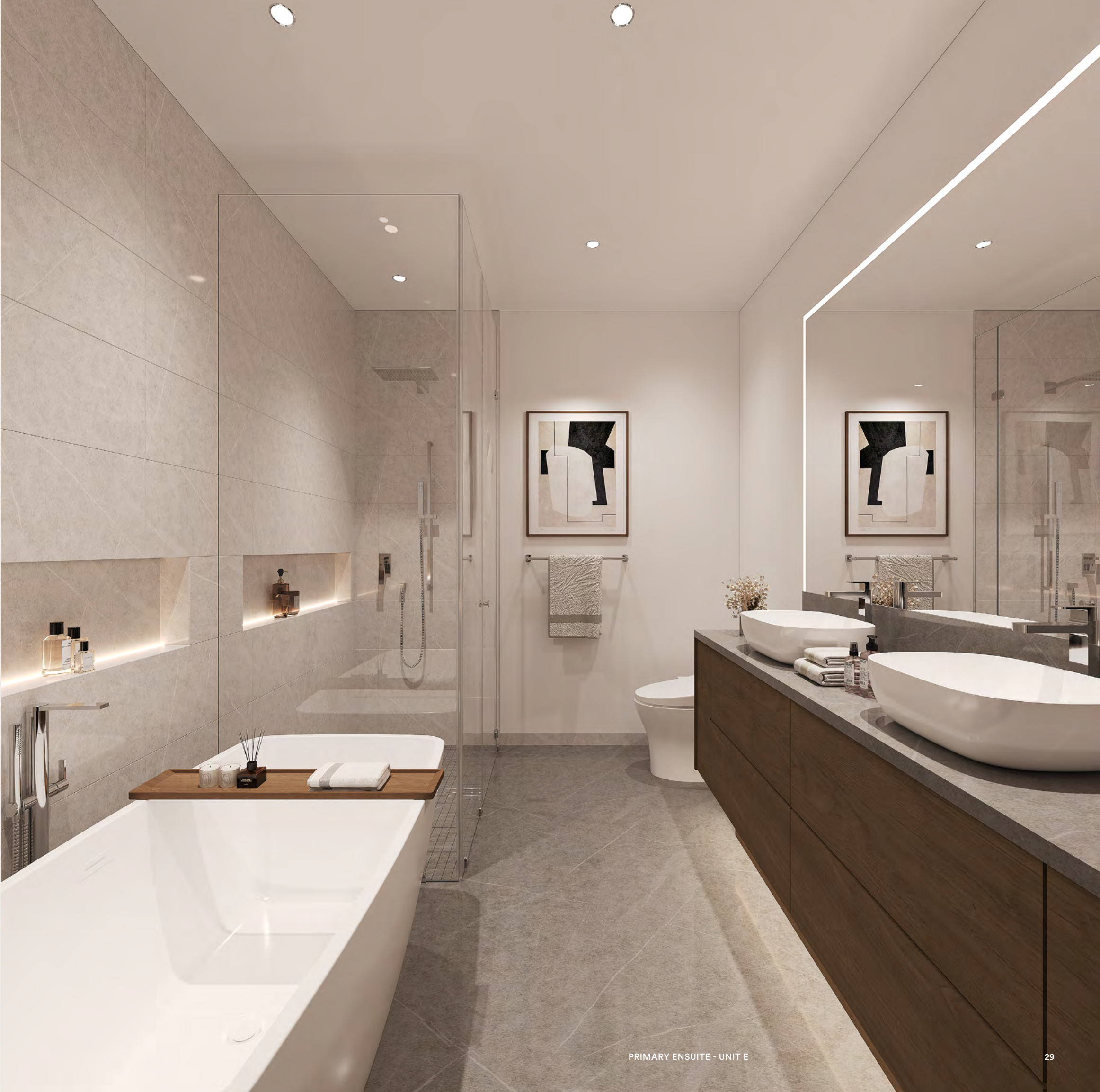
PRIMARY ENSUITE - UNIT E