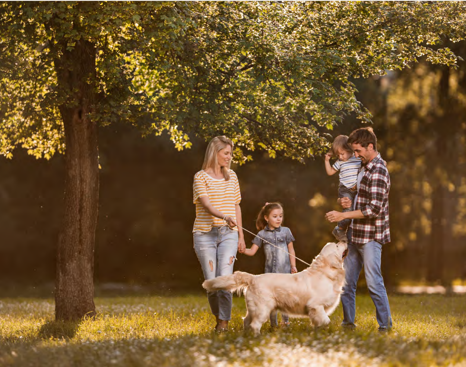
Shannon Mews Park - 2 min Drive / 10 min Walk

Forward-thinking in its location, AderaWest invites you to live at the brink of what makes Vancouver so famous: Modern amenities, an abundance of nature, high-walkability and easy access to the vibrant city centre.