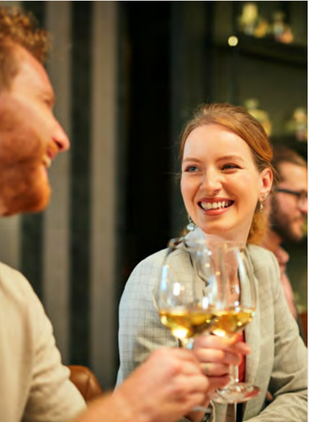
Barra 41 - 5 min Drive