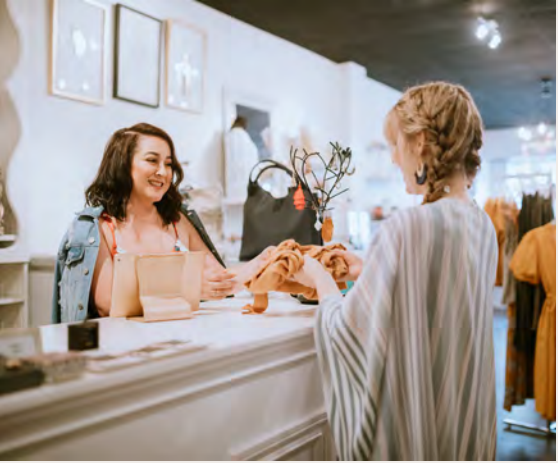
Kerrisdale Boutique Shops - 6 min Drive