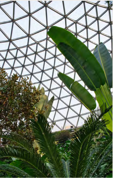
Queen Elizabeth Park-8 min Drive