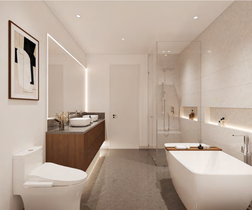
PRIMARY ENSUITE - UNIT A