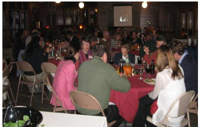
We had a great turnout and all enjoyed the bistro steak, vegetarian lasagna with many scrumptious sides and desserts.