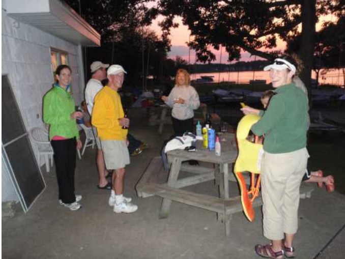
A group gathering before the second moonlight sail of the year.