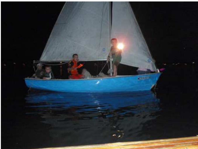
The Kurtzweil kids out during the moonlight sail.