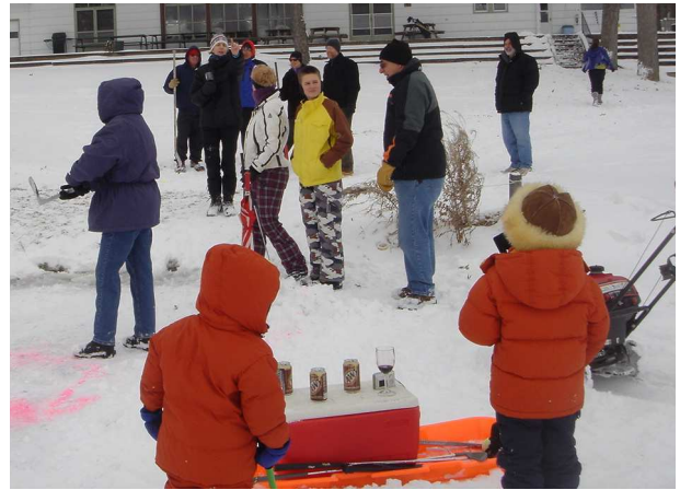
The crowd gathers at the first tee. Not sure why the kids are gravitating towards the drink cooler.

Bobble-head trophies were awarded to those that braved the elements.