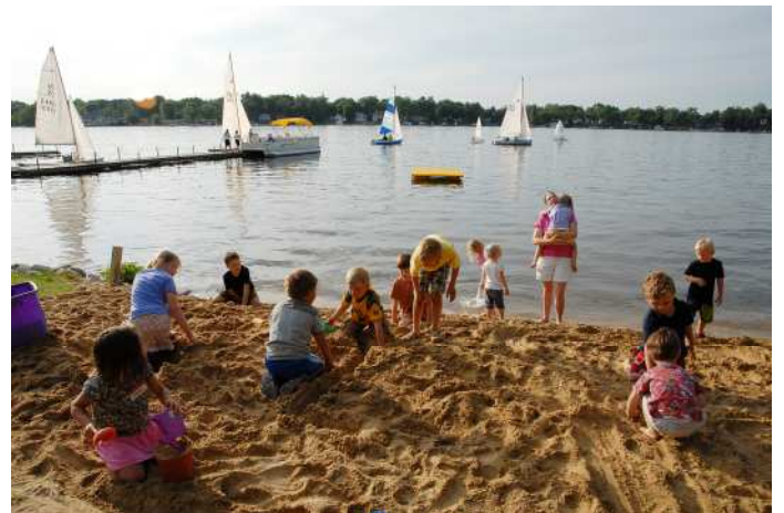
A wonderful turnout for our Open House/ June TGIF event. We had over 18 guest families in attendance. The beach area filled with kids is reminiscent of the late 60's and 70's at the club.