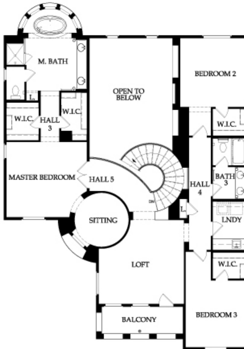
ELEVATION 'A' Second Floor

ALL MEASUREMENTS SHOWN ARE APPROXIMATE & NOT NECESSARILY TO SCALE. LOCATION, SIZE & CONSTRUCTION OF DOORS, WINDOWS, WALLS, FIREPLACES & ANY OTHER ITEMS DEPICTED MAY VARY DEPENDING ON ELEVATION, PRECEDENCE OR CHOICE OF OPTIONS & ARE SUBJECT TO CHANGE WITHOUT NOTICE. DUE TO NORMAL CONSTRUCTION TOLERANCES, THE ROOM SIZES SHOWN MAY VARY SLIGHTLY.