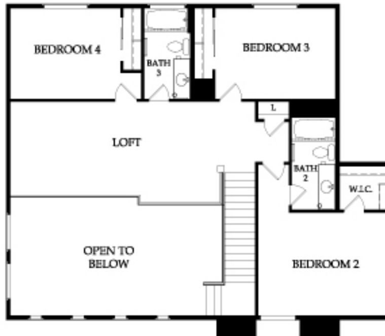
ELEVATION 'A' Second Floor