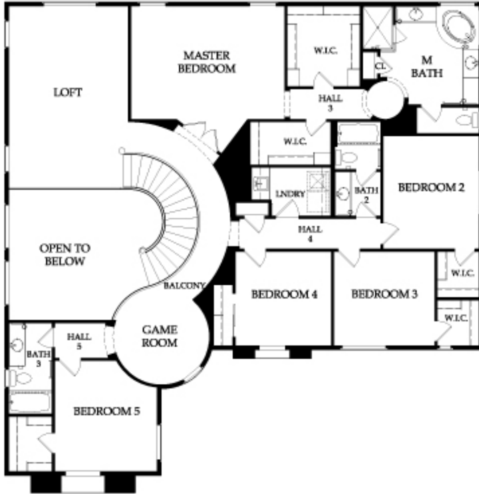
ELEVATION 'A' Second Floor

DRAWING NOT TO SCALE. ALL MEASUREMENTS SHOWN ARE APPROXIMATE & NOT NECESSARILY TO SCALE. LOCATION, SIZE & CONSTRUCTION OF DOORS, WINDOWS, WALLS, FINISHES & ANY OTHER ITEMS DEPICTED MAY VARY DEPENDING ON ELEVATION PREFERENCE OR CHOICE OF OPTIONS & ARE SUBJECT TO CHANGE WITHOUT NOTICE. DUE TO NORMAL CONSTRUCTION TOLERANCES, THE ROOM SIZES SHOWN MAY VARY SLIGHTLY.