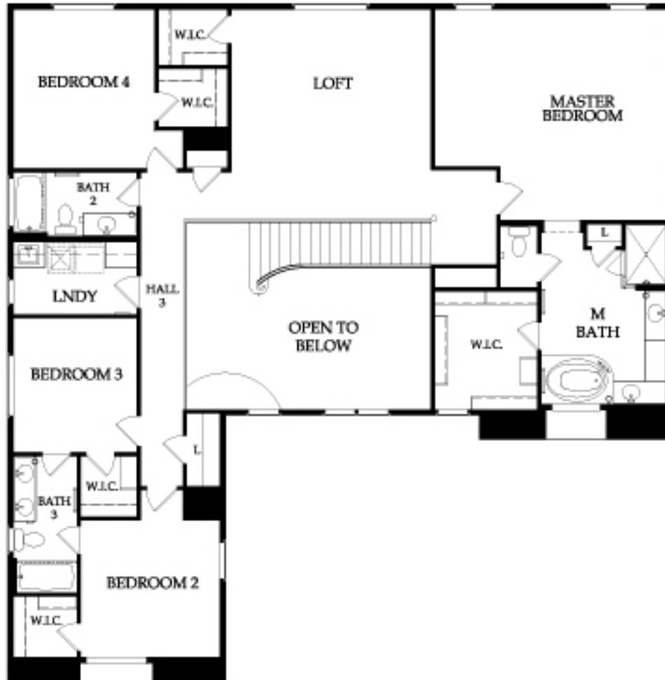
ELEVATION 'A' Second Floor