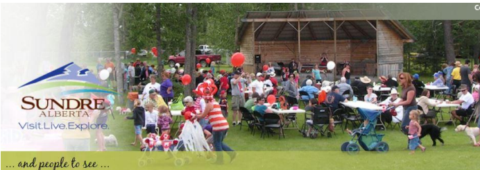
... and people to see ...

And a tourism destination? With its proximity to the mountains and all the adventure and nature-based tourism opportunities that come with that, its first-class golf courses, and its beautiful setting on the Red Deer River, Sundre attracts both short and long-term visitors. While some use the town as a base for exploring the great West Country for a weekend or a week, others have made Sundre their summer home-away-from-home. Though our year-round population is about 2700 residents, that number swells by thousands with more than 1000 RV lots located in and around Sundre.