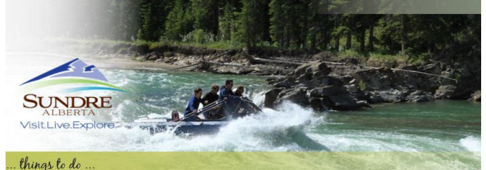
... things to do ...