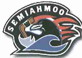
SEMIAHMOO MINOR HOCKEY ASSOCIATION