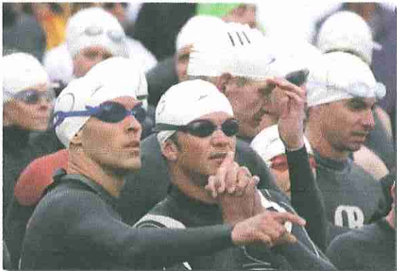
CRESCENT BEACH TRIATHLON

The Fraser Valley Real Estate Board launched the REALTORS® Make Good Neighbours Awards in 2002 to honour community volunteering by REALTORS®. Recipients are selected based on the amount of time they spend volunteering, level of responsibility undertaken as volunteers and overall impact of their efforts within their communities.