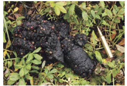
Between salmon runs, bears turn to berries to aid in their voracious caloric intake.

"Small, rounded ears," I note. The bear keeps coming, sweeping the bank for scent.