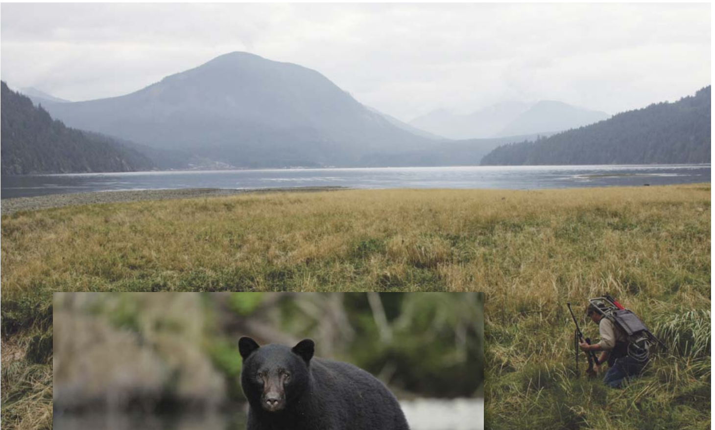
Black bears large and small visit salt marshes regularly. Guide Darren DeLuca studies the sign they leave behind to determine if there is a large boar in the area.