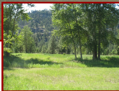
River view looking south eastward There are a variety of tree types