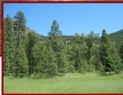
River view looking northward. All lots have good level grounds

Listed by: Jennifer Brock 250-446-2288 & Diane Biernaskie 250-446-2663 Macdonald Realty Okanagan South