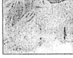
Peter Forsberg Expected to sign with an NHL club by Feb. 26 deadline.