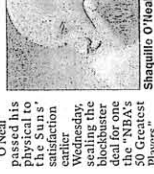
Shaquille O'Neal Injured star expected to counter Aristotle's big opponents.

PHOENIX — Shaquille O'Neal has a new home, and Steve Nash has a new go-to man. The National Basketball Association's Phoenix Suns acquired O'Neal, a 14-time all-star centre, on Wednesday from the Miami Heat for forward Shawn Marion and guard Marcuse Banks.