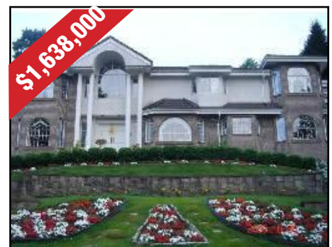
6656 DEER LAKE DR

To view interior photos of these homes visit our website