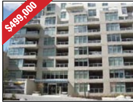
903 9232 UNIVERSITY CR