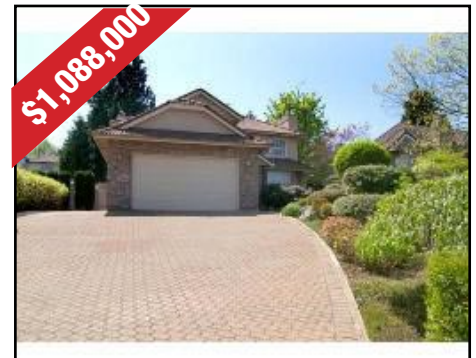
5387 RUGBY ST