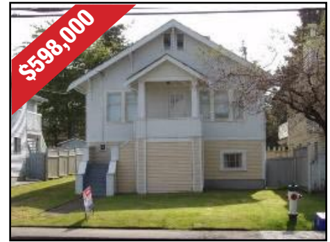
6958 NELSON AV