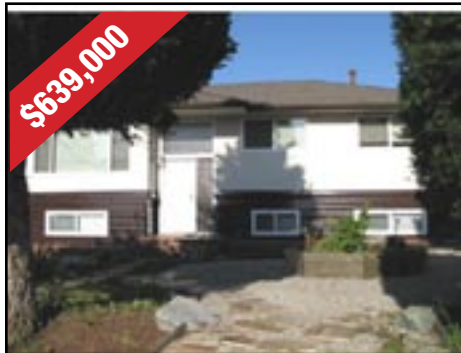
4912 PIONEER AV