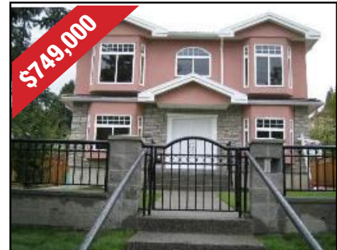
8017 10TH AV