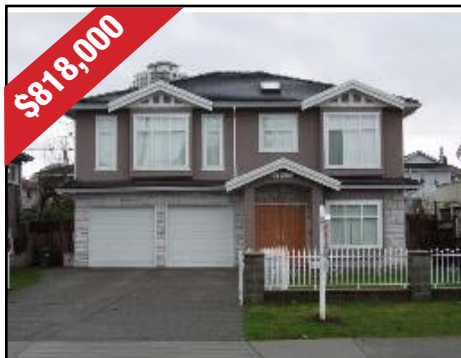
6807 LINDEN AV