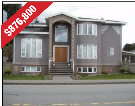
8206 14TH AV