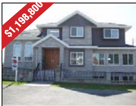
4888 WATLING ST