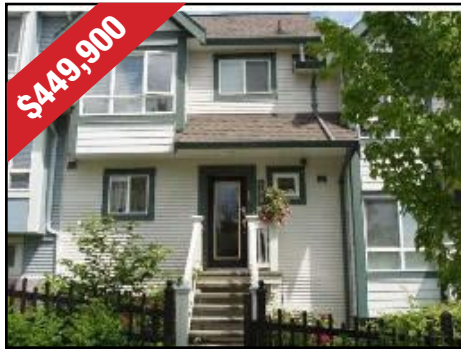
7492 HAWTHORNE TE