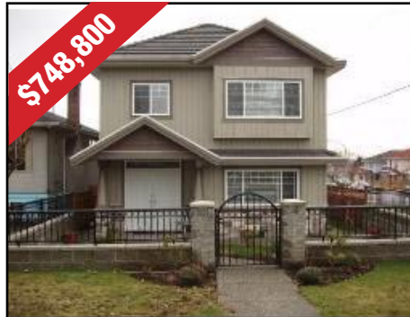
7608 14TH AV