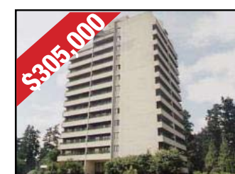
707-4194 MAYWOOD ST