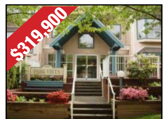
103-5568 BARKER AVE