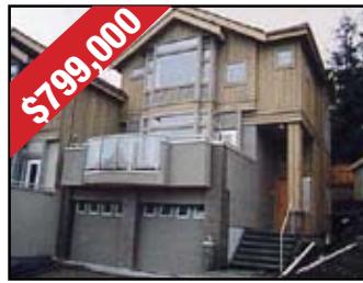
1-5239 OAKMOUNT CR