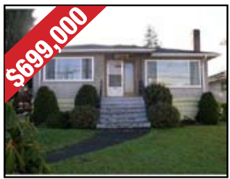
5358 NORFOLK STREET