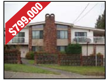
6311 WALTHAM AVENUE