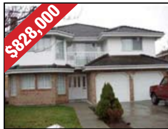
6657 NOLAN STREET