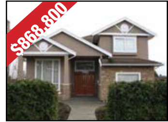
1940 EDINBURGH ST