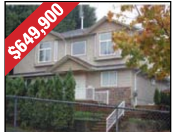
7639 CARIBOO ROAD