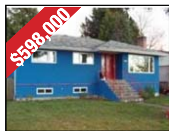
6950 MARLBOROUGH AVE