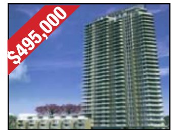
2202-4800 HAZEL ST