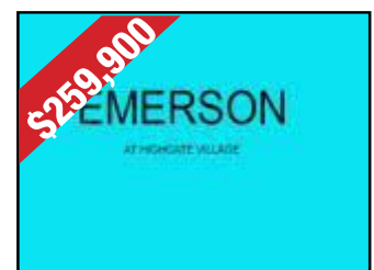
1001-7063 HALL AVE

To view interior photos of these homes visit our website