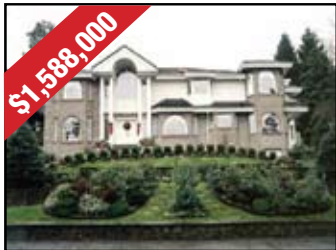
6656 DEER LAKE DRIVE