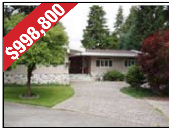
7365 PUNNET CLOSE