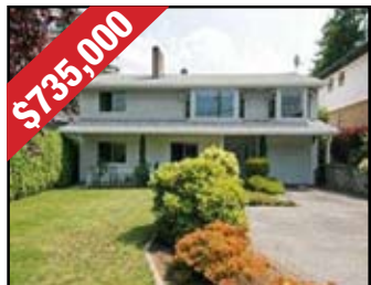
6164 BRANTFORD AVE