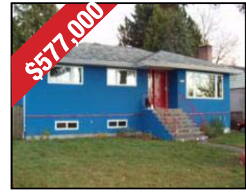
6950 MARLBOROUGH AVE