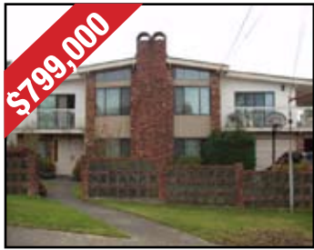
6311 WALTHAM AVE