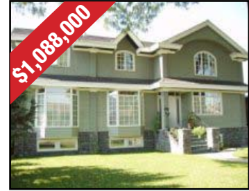
6793 ACACIA AVENUE