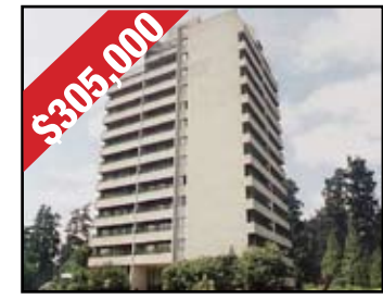
707-4194 MAYWOOD ST