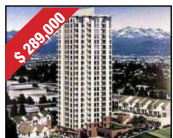
1303-7077 BERESFORD ST