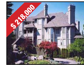
303-3733 NORFOLK ST

To view interior photos of these homes visit our website