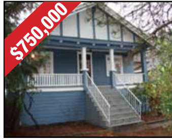
6591 SPERLING AVENUE