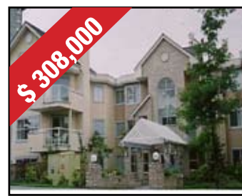
205-5565 BARKER AVENUE