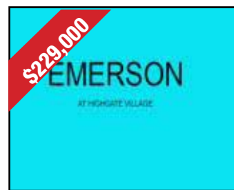
1001-7063 HALL AVENUE