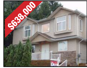
7639 CARIBOO ROAD