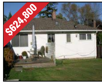
4246 PARKWOOD CRES