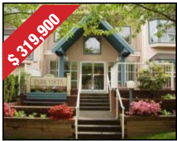
103-5568 BARKER AVE