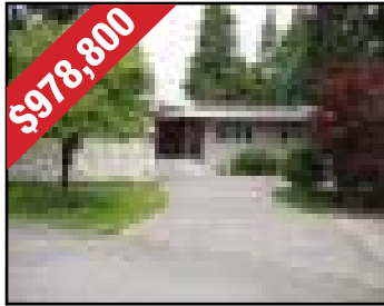
7365 PUNNETT CT