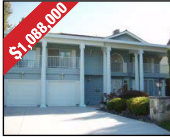
6370 BUCKINGHAM DR