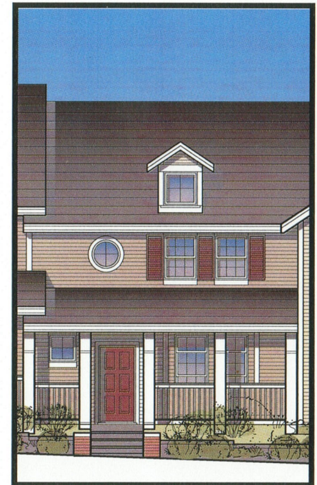
TRADITIONAL HOME (B) 2128 SQ.FT.