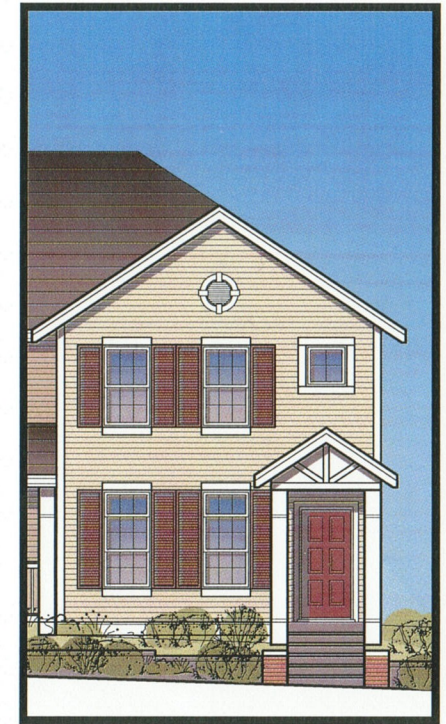
CONTEMPORARY HOME (A) 2180 SQ.FT.